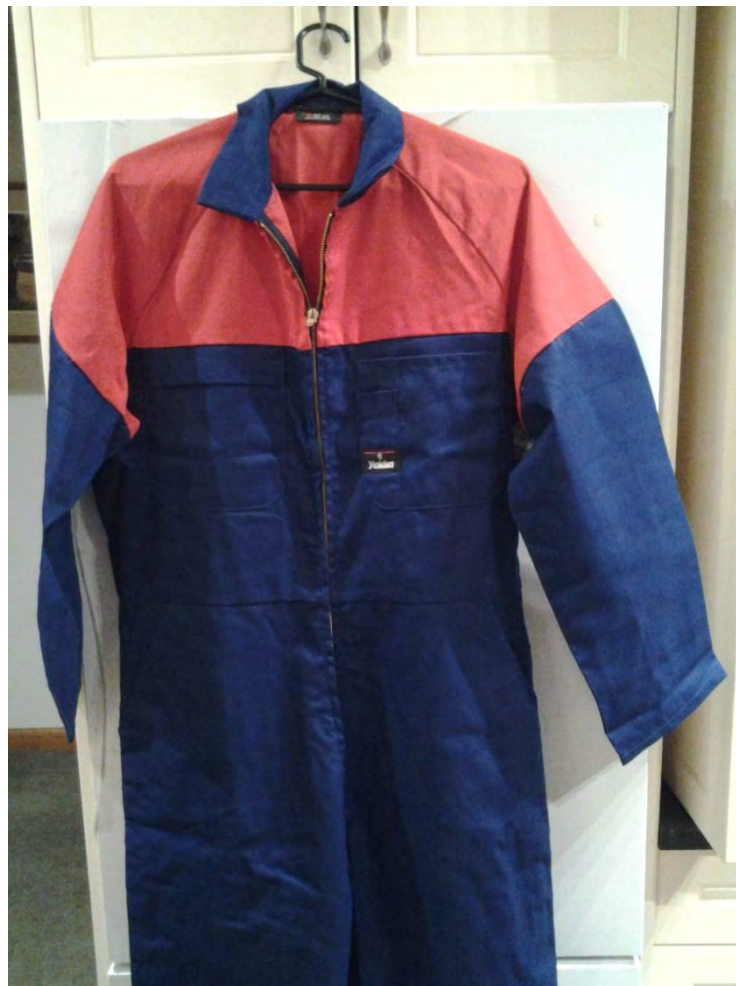
Red and Blue Overalls