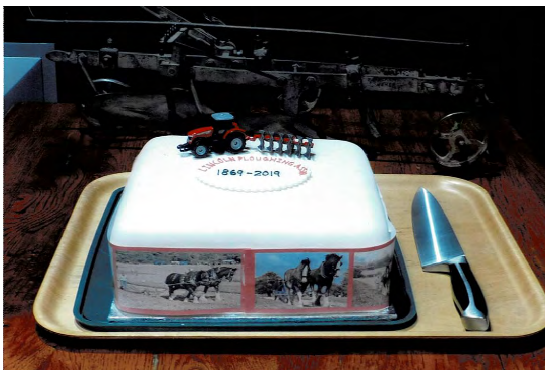
150 th Anniversary Cake