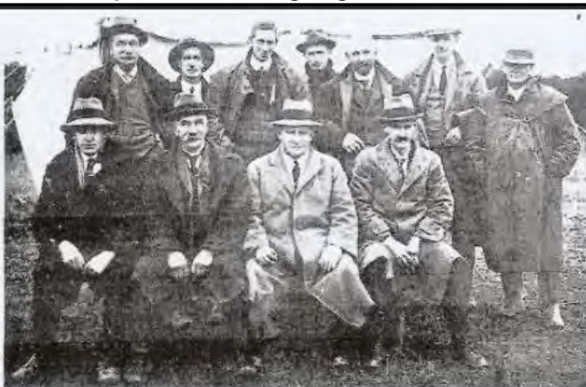
RAKAIA PLOUGHING MATCH ASSOCIATION 1923