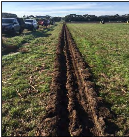
New Zealand / Australia Exchange