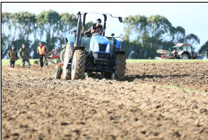
Nigel Woodhead and advisors