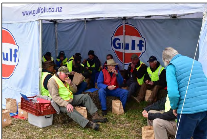
Judges lunch time