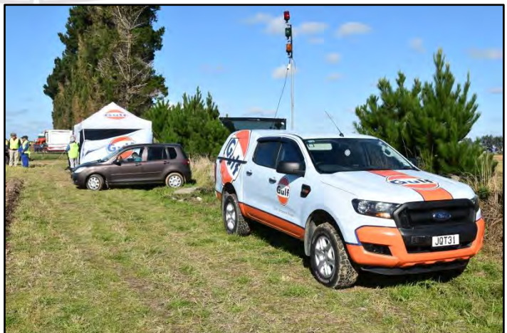
Sponsors of the Gulf Oil Silver Plough