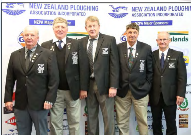
New Zealand Team Members, Germany 2018