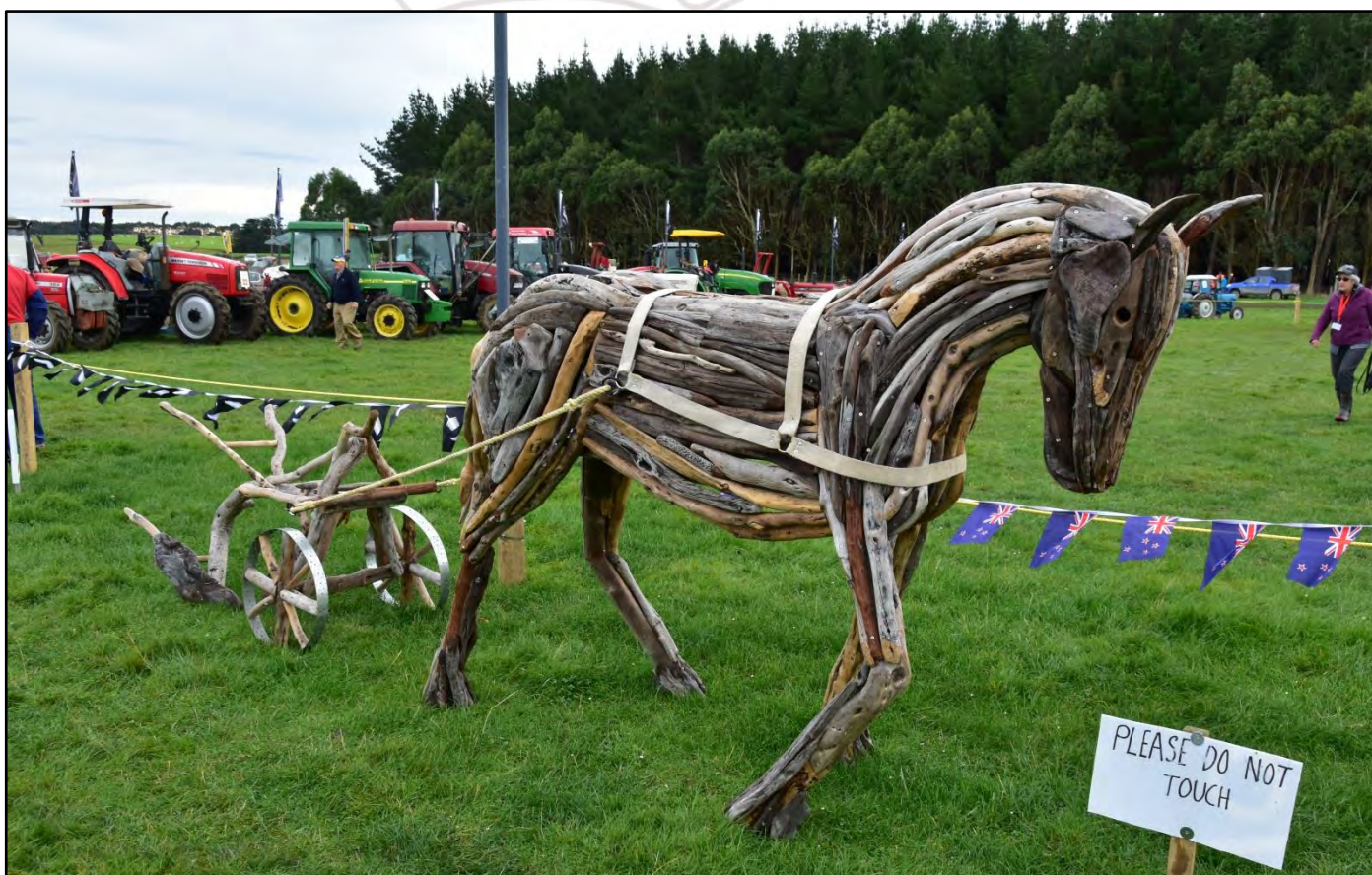
Horse and Plough sculpture made from driftwood